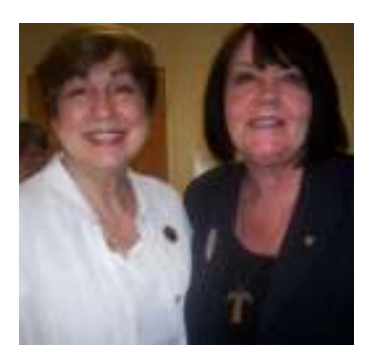
Formation Directors Workshop