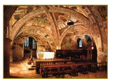
13 Finding the Body of St. Francis