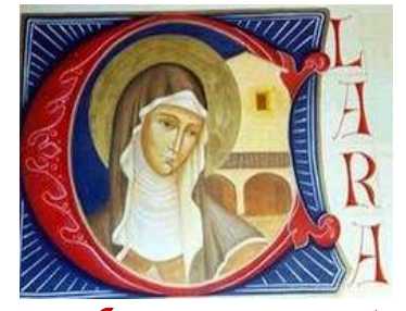
St. Clare Fraternity <u>April 2023</u>