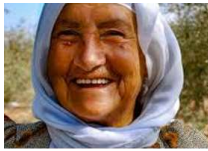
Laughing With St. Sarah (Patron saint of laughter)

March 9 April 13 May 11 June 8 July 13 August 10 September 14 October 12 November 9 December 14