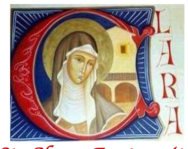
St. Clare Fraterníty <u>July 2023</u>