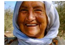
Laughing With St. Sarah (Patron saint of laughter)