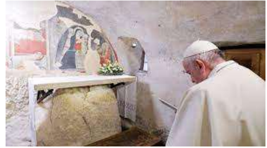
Pope Francis visiting Greccio

In honor of the 800 th Anniversary of Greccio, Christmas 2023 at the Vatican will recall the first ever manger scene , created by St. Francis. The unveiling will be on December 9 th .