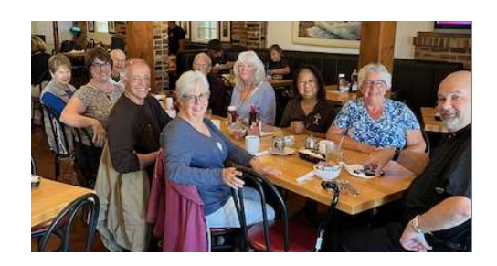
The fraternity gathered for breakfast after the celebration of mass