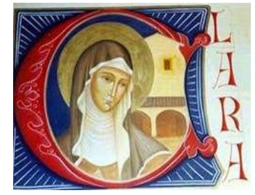
St. Clare Fraternity October 2023