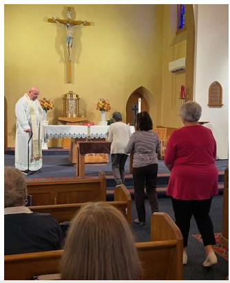
Fraternity members and parishioners coming forward to venerate the relic.