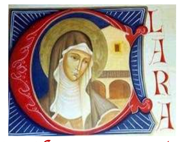
St. Clare Fraternity September 2023