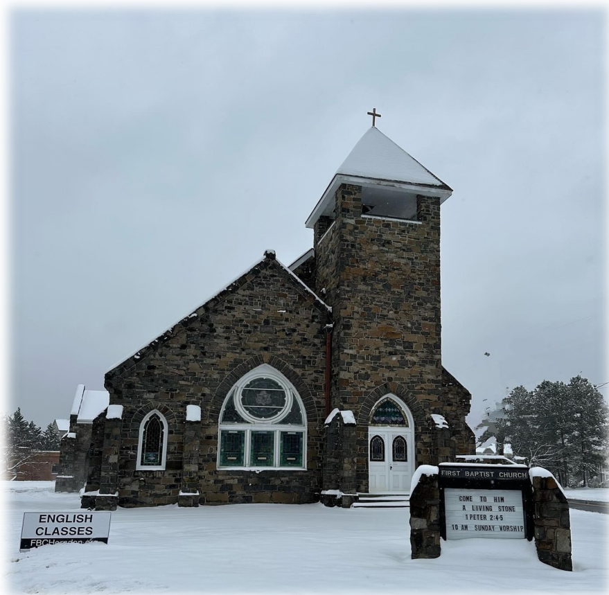
English classes are held at the First Baptist Church of Herndon, which was built in 1900.