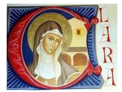
St. Clare Fraterníty February 2024