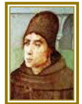
Bl. John Duns Scotus