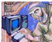
"Monk at Computer" from the Centre for the History of the Book, University of Edinburgh

http://www.littlethings.com/1917-chalkboards-untouched/?utm_source=amer&utm_medium=Facebook&utm_campaign=quiz