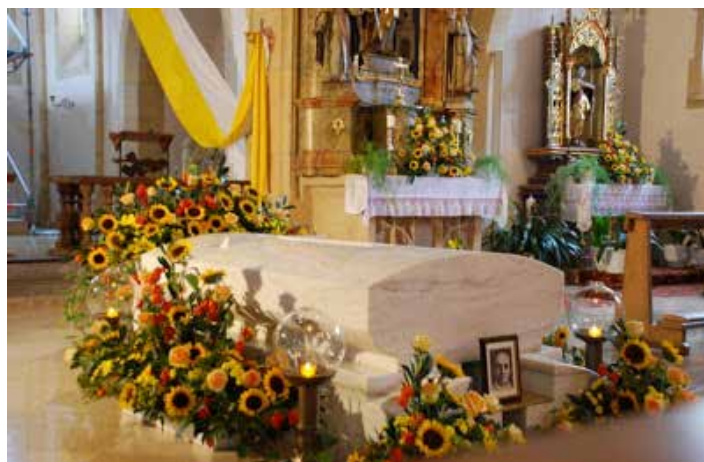
The Saint’s beautiful tomb in the parish church of Mindelstetten, Bavaria (Germany)