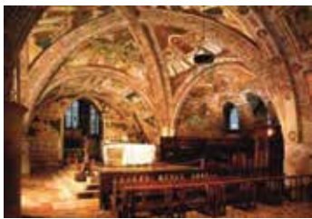
Crypt, St. Francis Basilica