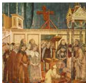
Celebration at Greccio