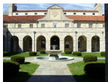
St. Anthony's Shrine

April 5, 2014 — St. Margaret of Cortona Day of Reflection for Inquirers and Candidates , Shrine of St. Anthony, Ellicott City, Md., 9:00 a.m. to 4:00 p.m. Registration form on page 6.