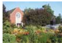
St. Francis University

July 10-14, 2014 — 6th OFS Summer Seminar, Spiritual Assistance, (open to all professed, inquirers and candidates) Saint Francis University, Loretto, Penn. (See information beginning on page 10.)