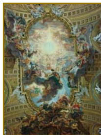
The Triumph of the Name of Jesus Giovanni Battista Gaulli