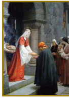
The Charity of St. Elizabeth of Hungary by Edmund Blair Leighton (1895)