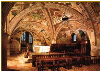
Crypt, St. Francis Basilica