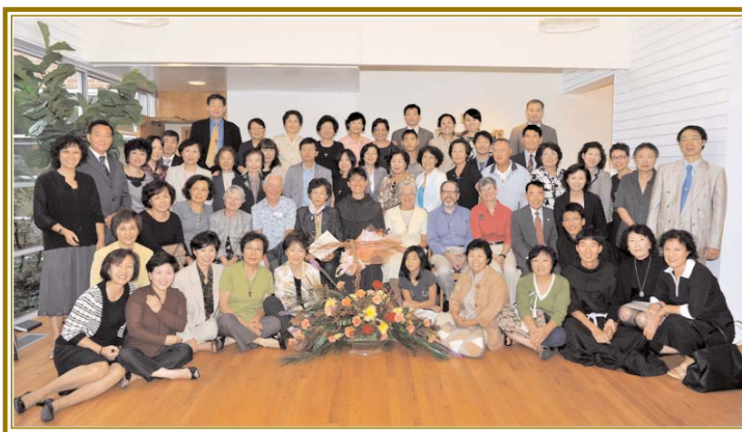
Members of the newly canonically established St. Bonaventure Fraternity in Fairfax, Va., and guests from around the region celebrate the long-awaited end of one phase of their spiritual journey and the start of a new phase in the journey.