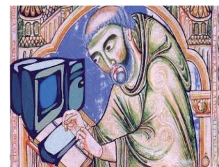
“Monk at Computer” from the Centre for the History of the Book, University of Edinburgh