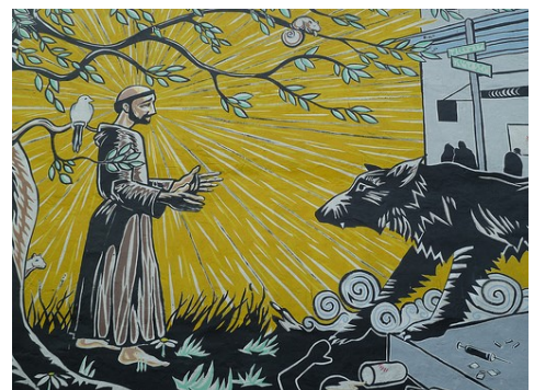
This 18 x 23 foot mural, painted by an Inn volunteer, towers over the Inn’s north wall and can be seen by passengers on the southbound El train.