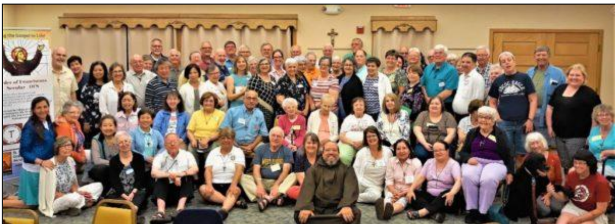
St. Margaret of Cortona Retreat at Priestfield, WV

July 1 – Bl. Junipero Serra, priest, I Order; 4 – St. Elizabeth of Portugal, queen, III Order; 7 – Bl. Davanzato, bishop, III Order; 8 – Bl. Gregory Grassi, bishop, and companions, martyrs, I and III Order; 9 – St. Nicholas Pick, priest, and companions, martyrs, I Order; 10 – St. Veronica Giuliani, virgin, II Order; 12 – Sts. John Jones and John Wall, priests, martyrs, I Order; 13 – Bl. Angeline of Marisciano, religious, III Order; 15 – St. Bonaventure, bishop, doctor, I Order; 16 – Canonization of St. Francis - Canonized 16 July 1228 by Pope Gregory IX; St. Francis Solano, priest, I Order; 18 – St. Simon of Lipnica; 21 – St. Lawrence of Brindisi, priest, doctor, I Order; 23 – Bl. Cunegunda, religious, II Order; St. Bridget of Sweden, widow, III Order; 24 – Bl. Louise of Savoy, widow, II Order; Bl. Modestino of Jesus and Mary, religious, I Order; Bl. Antonio Lucci, bishop, I Order; 27 – Bl. Mary Magdalene of Martinengo, virgin, II Order; 28 – Bl. Mary Teresa Kowalska, virgin, martyr of Poland, II Order; Bl. Mattia Nazarei, virgin, II Order.