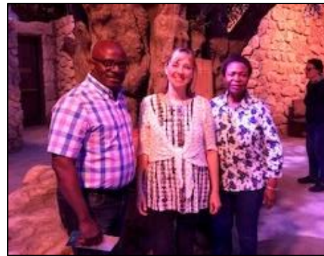
Group photos from Museum of the Bible visit