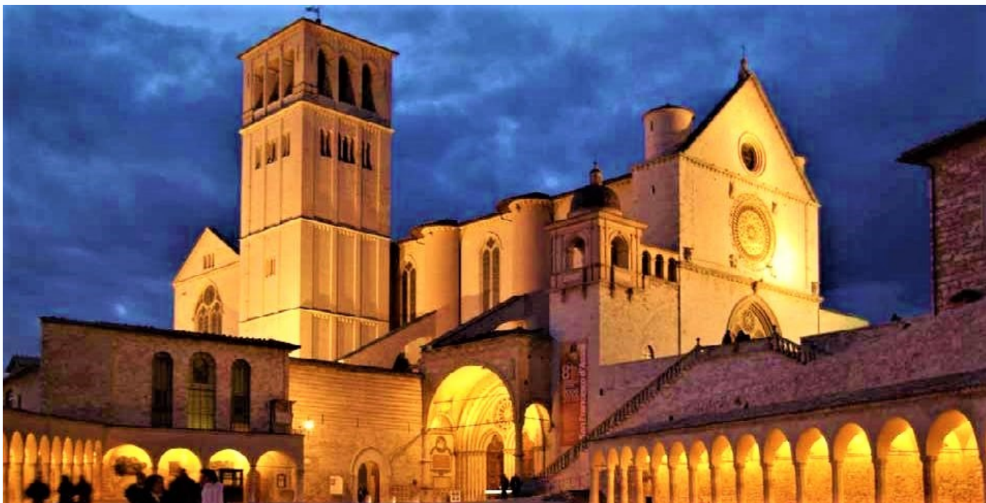
Basilica of St. Francis in Assisi