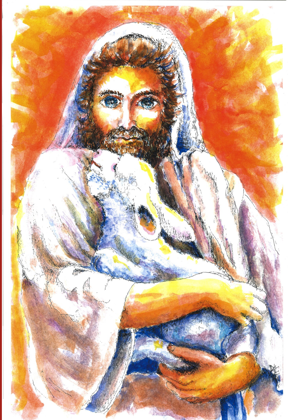
The Good Shepherd by our very own Dale Eppig