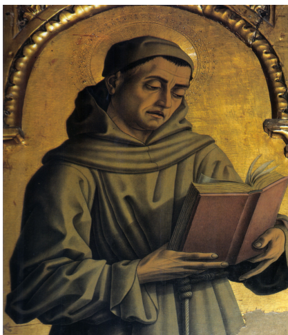
Bl. John Duns Scotus pray for us.

Mindful that they are bearers of peace which must be built up unceasingly, they should seek out ways of unity and fraternal harmony through dialogue, trusting in the presence of the divine seed in everyone and in the transforming power of love and pardon. Messengers of perfect joy in every circumstance, they should strive to bring joy and hope to others. Since they are immersed in the resurrection of Christ, which gives true meaning to Sister Death, let them serenely tend toward the ultimate encounter with the Father.