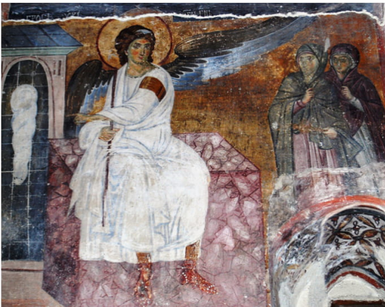
Affreschi dal Monastero di Mileševa, Serbia, cca 1236

Perché cercate tra i morti colui che è vivo? Non è qui, è risuscitato. (Lc. 24.5-6.)