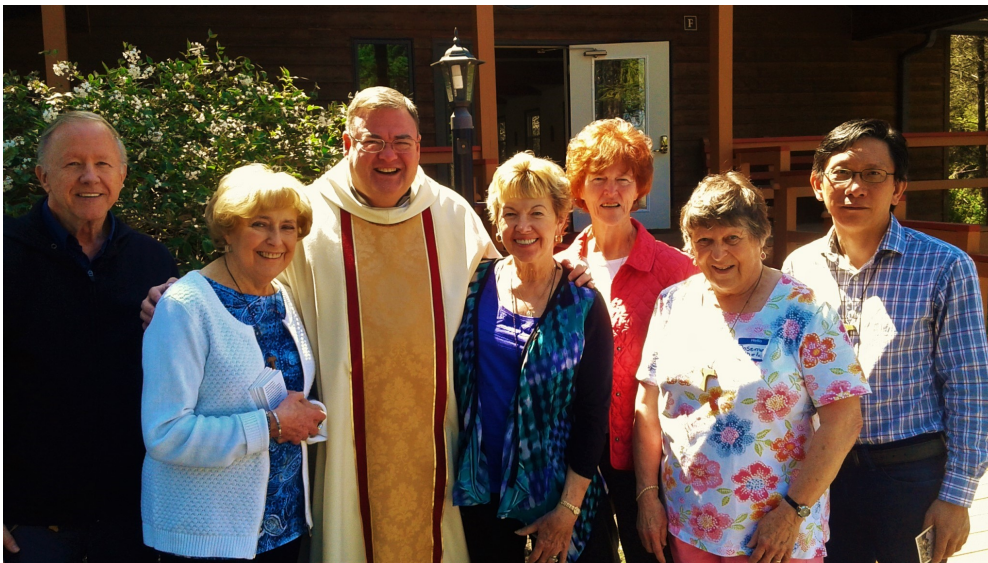
May 2016 Regional Retreat at Priest Field

As our lives return to normal and are able to attend monthly gatherings, I want to talk about what does it mean to be in fraternity. I read with interest the 2019 Annual Reports I received from each fraternity minister, many of the fraternity's apostolate(s) were filled with a genuine Franciscan spirit. Although we are not a religious Order but a Secular Order, as such we are a living Franciscan community, therefore, an active fraternity, life is essential for the growth of the Order.