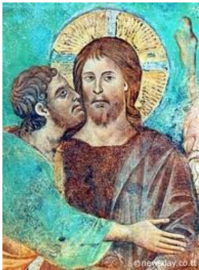
Cimabue "The betrayal of Christ"