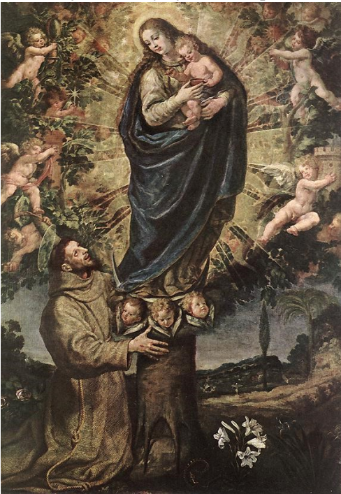
Vision of St. Francis of Assisi by Carducho