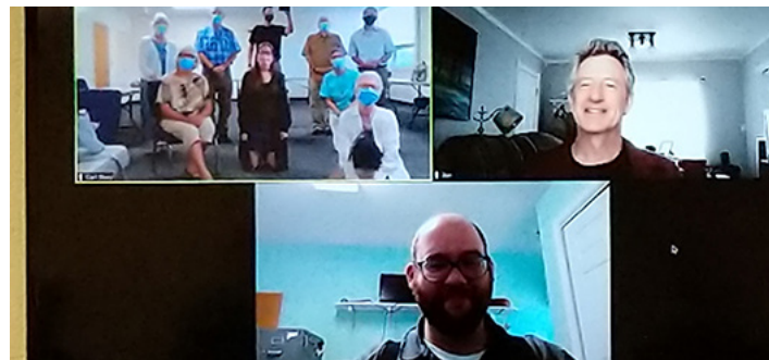
Mt La Verna Fraternity (Charlottesville, Va) welcomes 5 new Candidates, as they celebrate their first in-person fraternity meeting since the pandemic began. Zoom was used for those who could not physically attend.