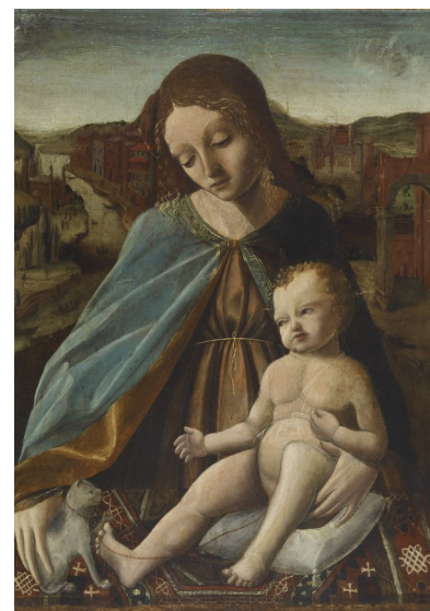
Madonna and Child with a Cat, Attributed to the Master of Pala Sforzesca, oil? On wood panel

I would like to challenge everyone this month to go and look at the slideshow, reflect on the questions, try our hands at writing this form of prayer, and share our final efforts. If unable to see the slideshow, please contact me and I will assist.