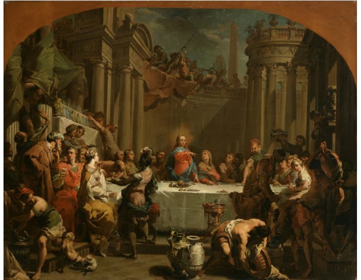
The Marriage at Cana by Gaetano Gandolfi 1766

Another jar of the six St. Anthony sees as symbolizing the watery cleansing of forgiveness. We see it as washing away our sins for which we are sorry. Again, it is always about the other. Forgiveness is for us and is an undeserved cleansing that we really do not deserve but we really and truly need. We have the ability and strength to seek forgiveness in the first place only because we respond positively to God's gift of grace. Without God's grace, or if we reject God's grace we would be unable to seek forgiveness in the first place. I want that whole jar poured over me because I know that it is needed and necessary. St. Anthony leaves us considering these six "Cleansings" in a way that we, as penitents of St. Francis are called to do in our response as followers of the Lord.