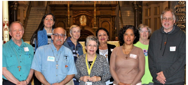
2018 St. Margaret of Cortona OFS Regional Council (partial)