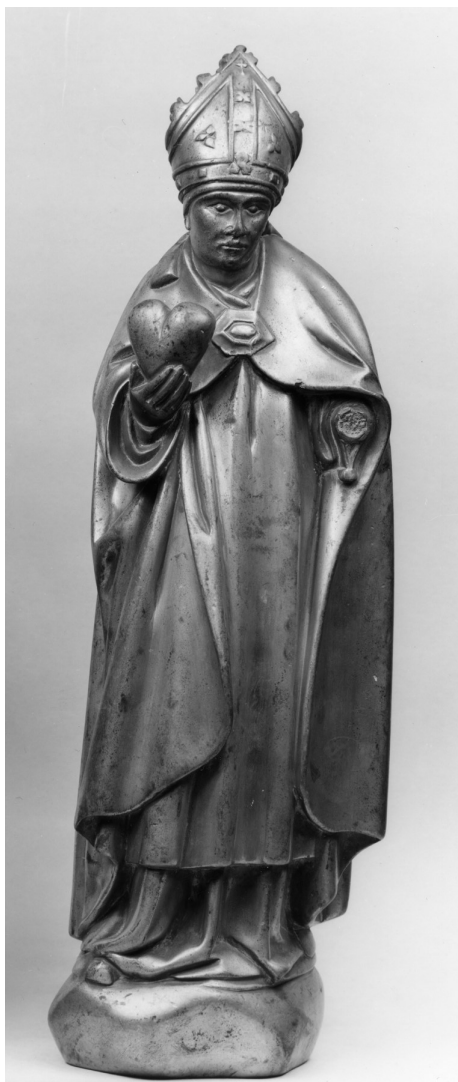
St. Augustine of Hippo, 15th Century bronze, Belgium, CC0 The Walters Art Museum