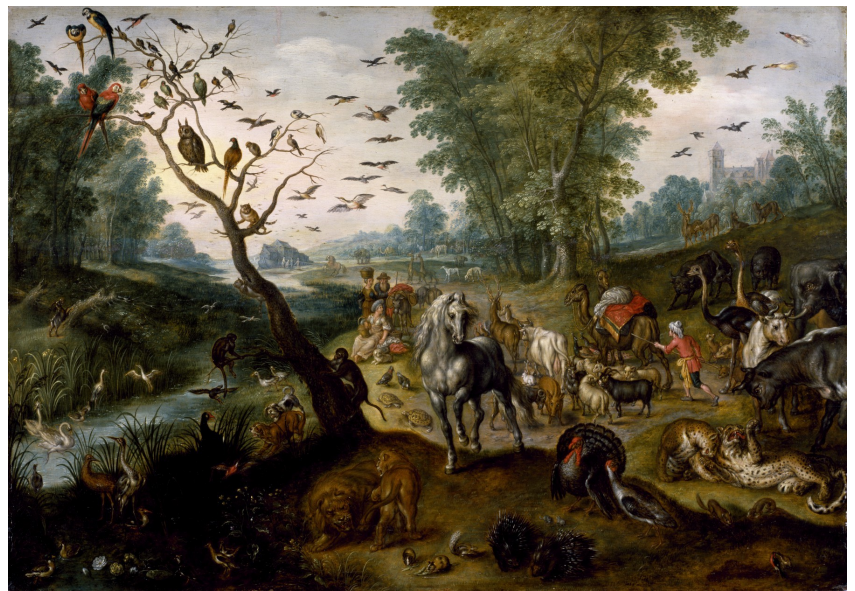
Noah's Family Assembling the Animals Before the Ark by Jan van Kessel II