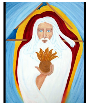
Image of the Sacred Heart of God the Father → MovingHeartFoundation.com