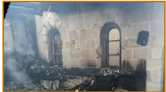
File photo of the vandalization of the Basilica of the Multiplication of the Loaves and Fishes in Tabgha in 2015.

However, the heads of Christian Churches say this commitment is “betrayed by the failure of local politicians, officials, and law enforcement agencies” to put a stop to activities of radical groups threatening Christians.