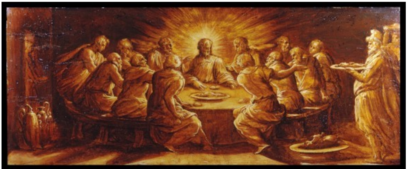
The Last Supper by Giorgio Vasari II, Florence, Italy ~1545, CC0 The Walters Art Gallery