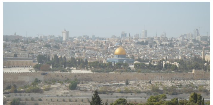
Along the Palm Sunday Road View of the Old City of Jerusalem