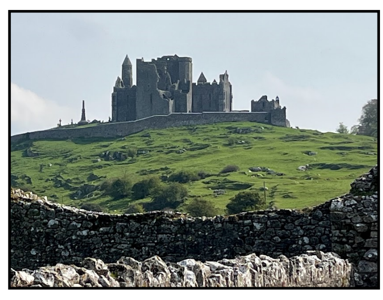
The Rock of Cashel