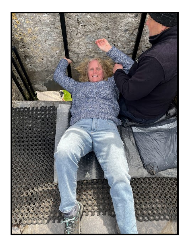
Kissing the Blarney Stone