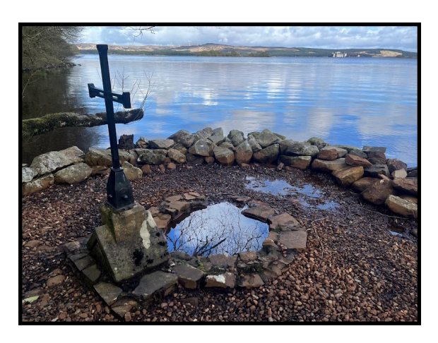
St. Brigid's Well