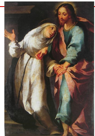
Echange des coeurs by Ventura Salimbeni, 16th century; public domain