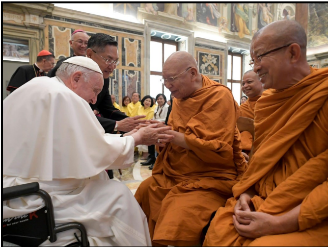
Pope Francis smiles as he greets a member of a delegation of Buddhists from Thailand in Clementine Hall at the Vatican June 17.