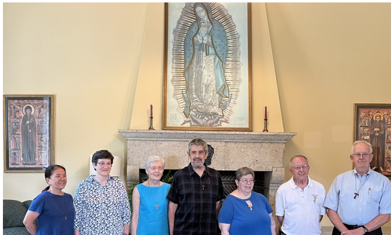
2022-2025 Council (Left to Right)