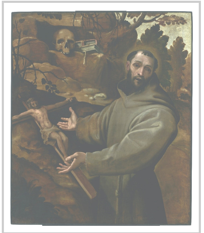
(Image of St. Francis, Workshop of Annibale Carracci, 1560-1609, The Walters Art Gallery, CC0, brightness increased)

“Recognize in this bread what hung on the cross, and in this chalice what flowed from his side... whatever was in many and varied ways announced beforehand in the sacrifices of the Old Testament - pertains to this one sacrifice which is revealed in the New Testament.” ~St. Augustine