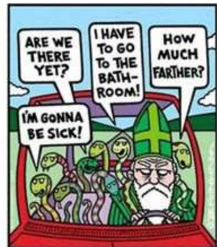
St. Patrick driving the snakes out of Ireland.