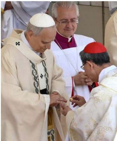
Pope Leo receiving the Ring of the Fisherman from Cardinal Tagel of the Philippines

O God, shepherd and ruler of all the faithful, look favorably on your servant Leo, whom you have set at the head of your Church as her shepherd; grant, we pray, that by word and example he may be of service to those over whom he presides so that, together with the flock entrusted to his care, he may come to everlasting life. Through our Lord Jesus Christ, your Son, who lives and reigns with you in the unity of the Holy Spirit, God, for ever and ever. Amen