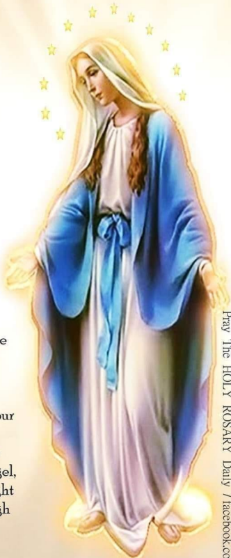
Pray The HOLY ROSARY Daily / facebook.com

Pour forth, we beseech You, O Lord, Your grace into our hearts: that we, to whom the Incarnation of Christ Your Son was made known by the message of an Angel, may by His Passion and Cross be brought to the glory of His Resurrection. Through the same Christ our Lord. Amen.